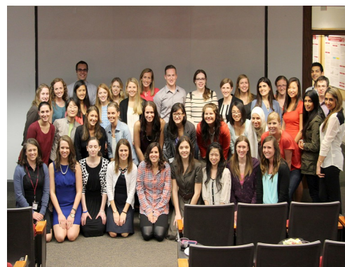
NECO BSK Ceremony, 2014

In addition, NECO BSK chapter hosts an informal information session about residencies. This provides a platform for third year students to meet with residents from a variety of NECO-affiliated residency programs. The goal of the program is to allow third year students more insight into the day-to-day life of a resident and the specific experiences gained as a part of each program.