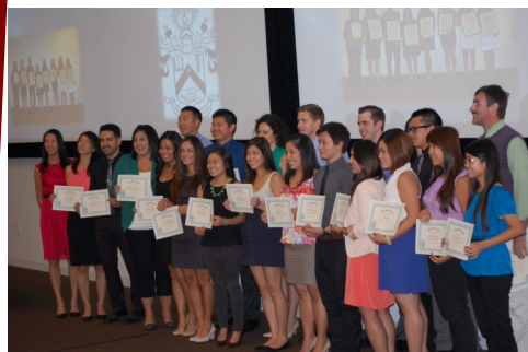
Western's Founder's Day

When WUCO's BSK Board was elected, we wanted to meet BSK's Mission to stimulate scientific attainment and academic excellence. For this purpose we organized and hosted three Mock Proficiencies for Clinical Skills to serve the both First Year and Third Year classes. The first mock proficiency helped to reinforce clinical procedures specific to Vision Screenings. The second proficiency provided guidance to students for entrance testing techniques. The third proficiency aimed to prepare the Third Year class for Part Three of NBEO examination. With the investment of time from both BSK Member but importantly many of WUCO's dedicated Professors, all four stations were accurately represented, including the Injections component in Station four.