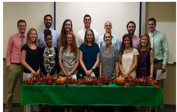
Annual UAB BSK New Member Banquet

In the Spring semester, we held our annual fundraising breakfast, selling bagels and fruit to help support our Mock Boards event. At the Awards Ceremony for graduation, we celebrated and honored 25 graduating members (21 were members all 4 years!). During the summer semester, we hosted a Mock Boards event that allows 4 th year students to practice for Part III boards.