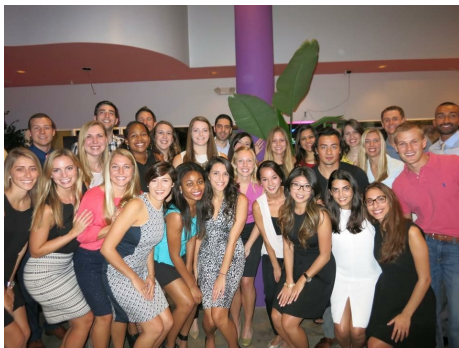
NOVA BSK Students

The 2015-2016 academic year was an exciting one for the Nova chapter of Beta Sigma Kappa. There were celebrations, starting with the fantastic induction dinner our executive board hosted to welcome 38 new members into our society. We also celebrated our successes at the end of the year with our annual fundraising event to raise money for the Lighthouse of Broward County. Our chapter this past year was also deeply involved in assisting the Nova student body learn and succeed. As individual and group tutors, our members shared their knowledge with their peers. As a chapter, we also put on our annual Mock Clinical Proficiencies weekend, where we simulate the practical exam Nova students need to master in order to move on to their primary care rotations in order to help out our OD2s. All-in-all this past year was a success, and we look forward to the upcoming year!